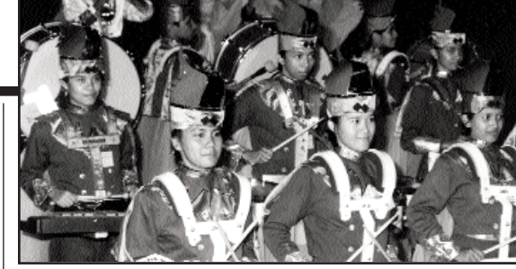
University Gojah Mada, Indonesia, 1991.

"I have consulted with a group from a high school named Victoria Institution located in Kuala Lumpur. They are previous national champions and have performed in a couple of World Showband competitions in Australia and Canada, and will be joining the championship in Monza this July," he