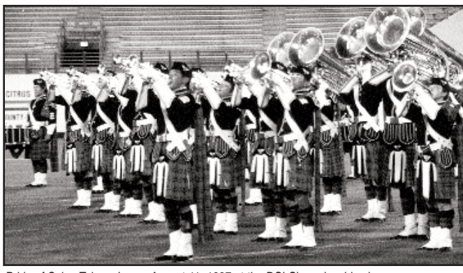
Pride of Soka, Tokyo, Japan, August 11, 1997 at the DCI Championships in Orlando, FL