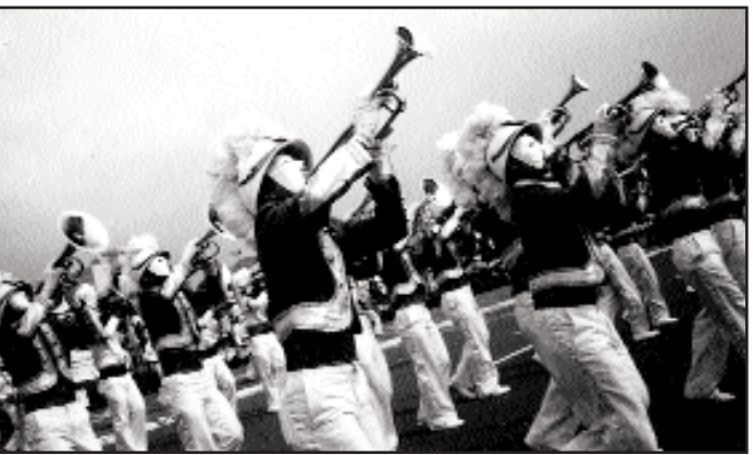
"Phantom of the Opera," San Sebastian College Drum & Bugle Corps, Cayite City, Philippines, October 27, 1996.