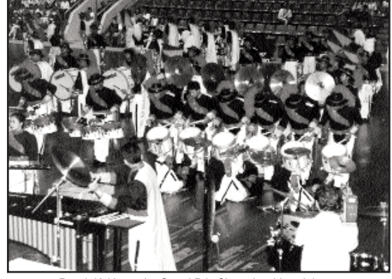
Pupuk Kaltim at the Grand Prix Championships, Jakarta, Indonesia, December 31, 1995.