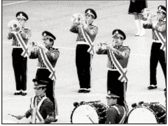
Olayama, Japan, Police Drum & Bugle Corps, 1988

He continues, "Since drum corps is primarily of Western culture, the group of people that are interested in this kind of art is very small. Few Thai people are aware of the various instruments or even the difference between woodwind and brass instruments. "The target group is therefore very small