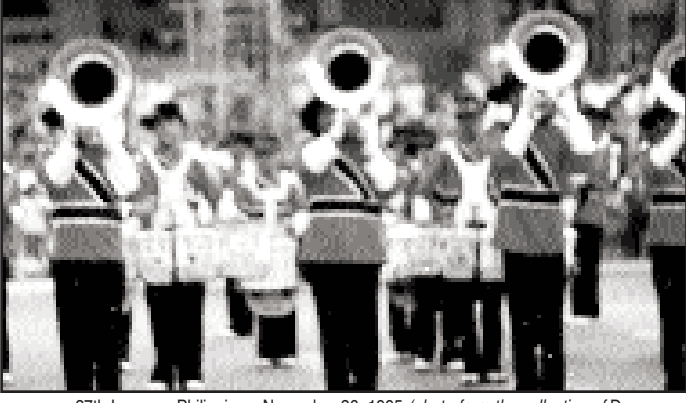
27th Lancers, Philippines, November 26, 1995 (photo from the collection of Drum Corps World).